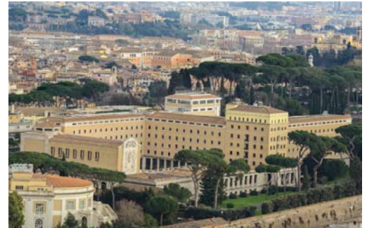
North American College in Rome